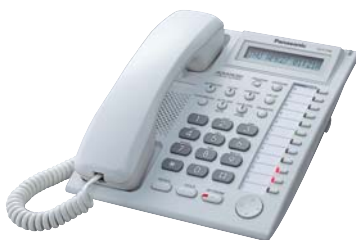
■ KX-T7730 LCD, Speakerphone Unit