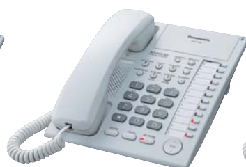
■ KX-T7720 Speakerphone Unit