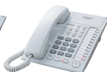
■ KX-T7750 Monitor Unit